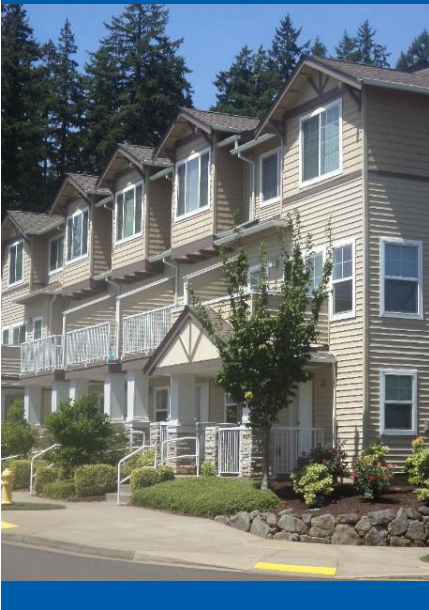
Attached homes in the Progress Ridge neighborhood