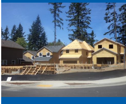
Construction of Summer Falls, one of Beaverton's newest subdivisions

Beaverton Community Vision, Enhance Livability Mini-Vision Statement