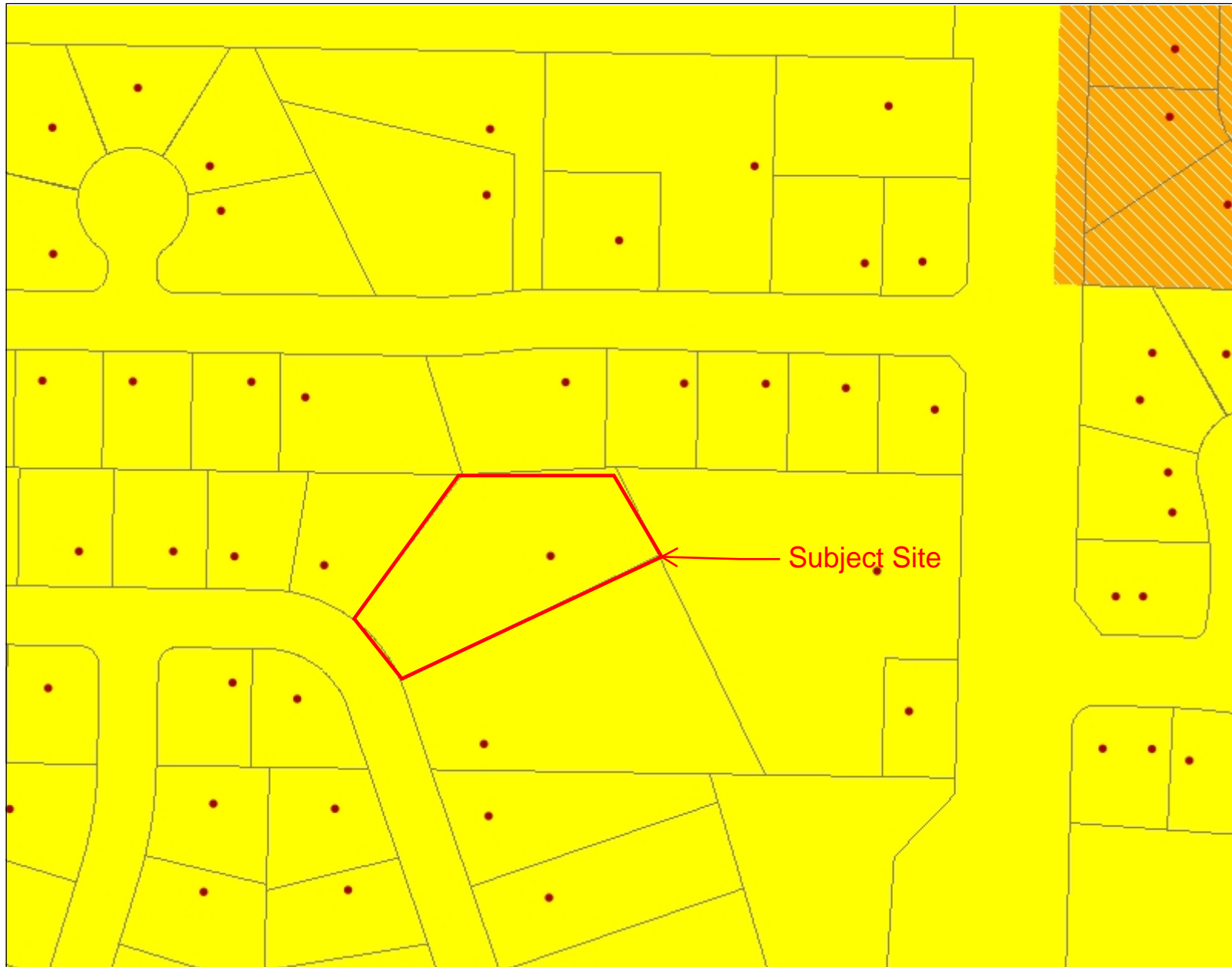
Exhibit 1.1 Zoning and Vicinity Map