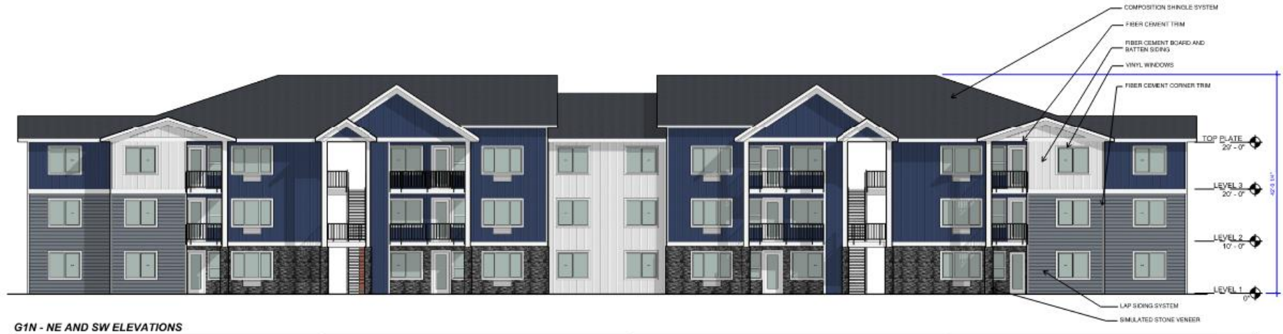
G1N - NE AND SW ELEVATIONS