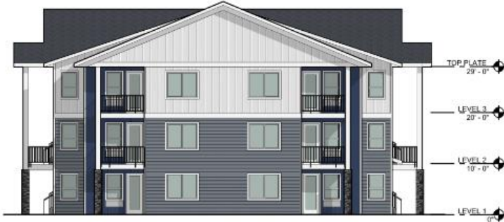
G3N - EAST AND WEST ELEVATIONS