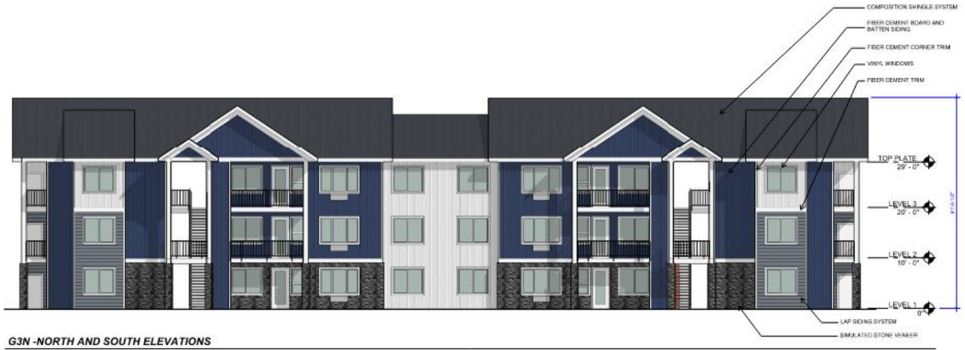
G3N - NORTH AND SOUTH ELEVATIONS