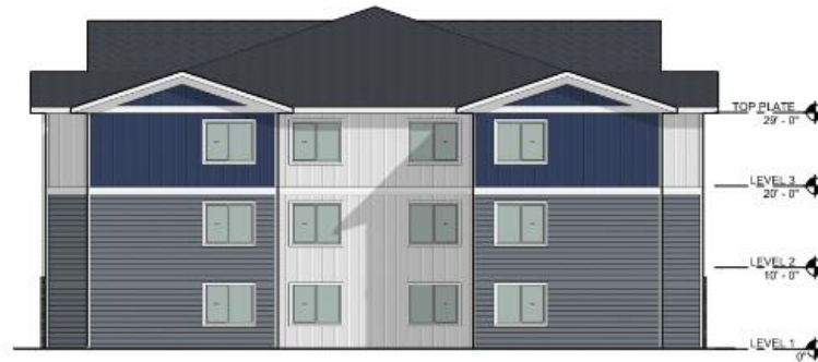
G1N - NW AND SE ELEVATIONS